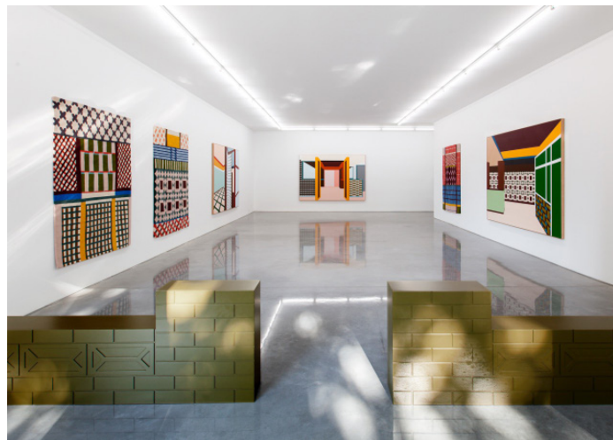
Image: 6 Metres of Plinth, 2016, Artspace, Sydney courtesy of the artist