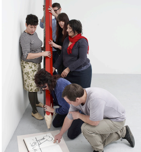
DAMP Big Pencil Drawing , 2010, acrylic on photo